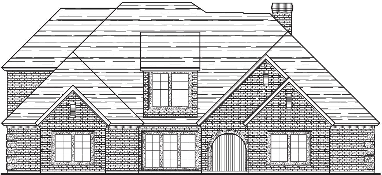
FRONT ELEVATION PLAN 4252

Plans, specifications and prices subject to change without notice. Front windows vary per elevation. Square footage are approximate.